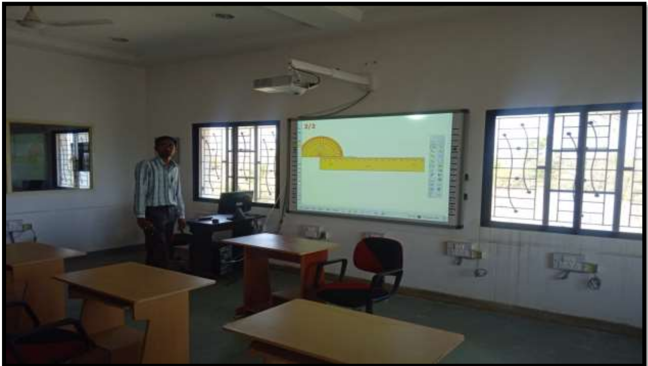
SMART CLASS ROOM WITH DIGITAL INTERACTIVE BOARD