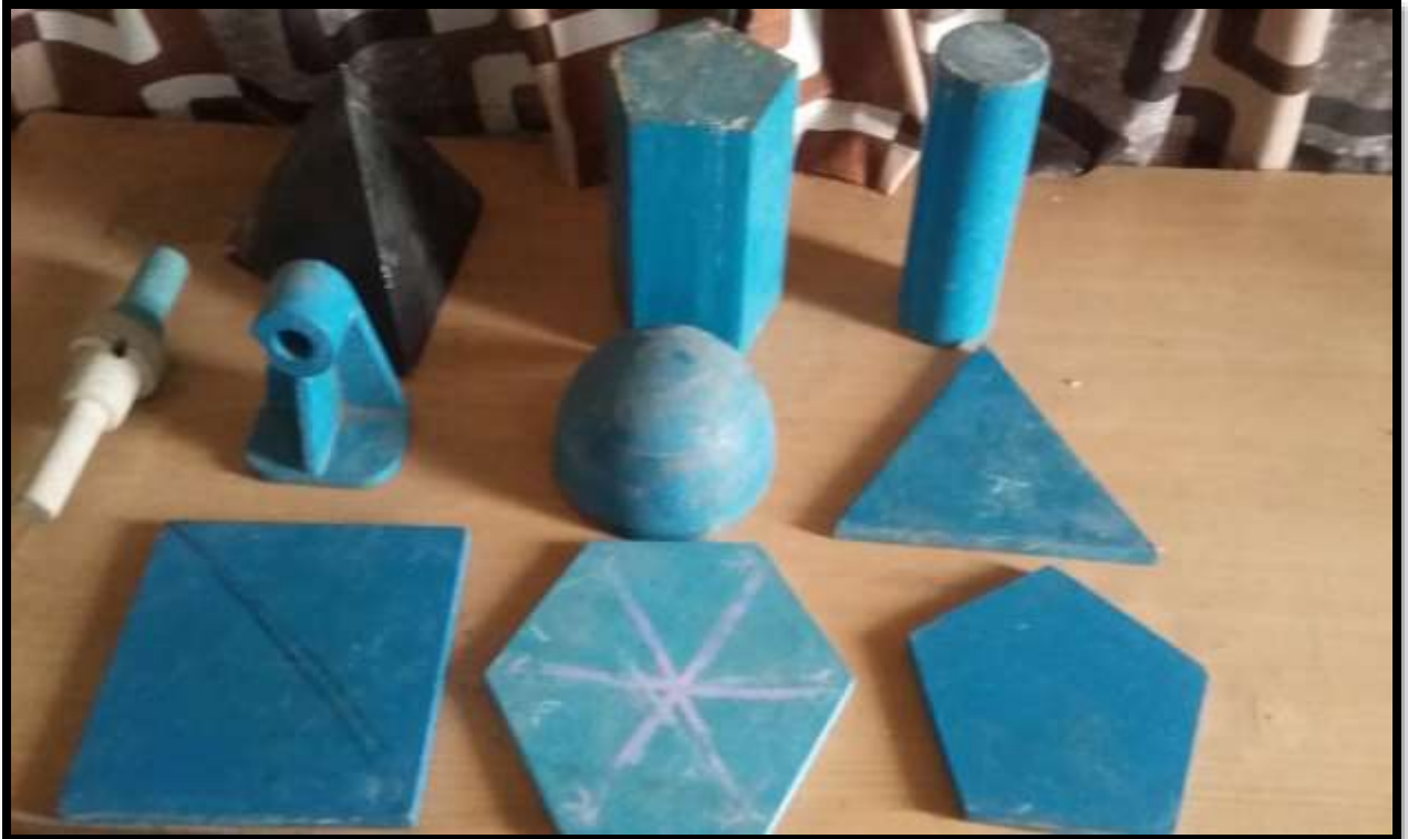
ENGINEERING DRAWING TOOLS