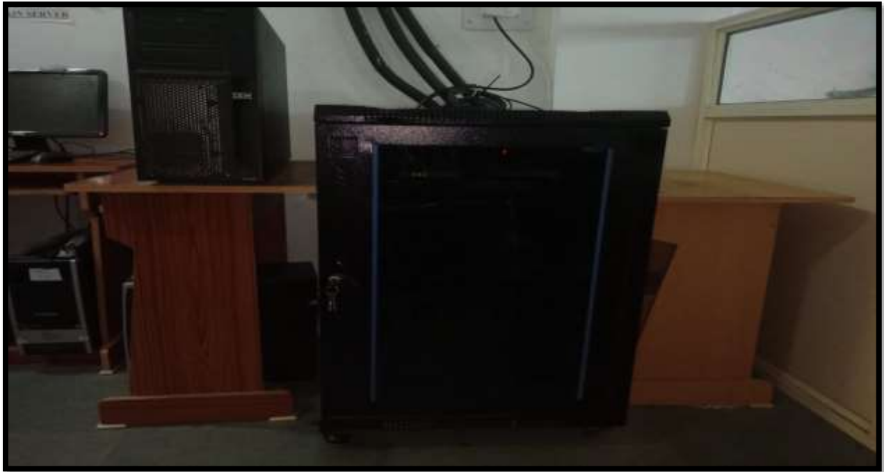
INTERNATE AND WI-FI SERVER