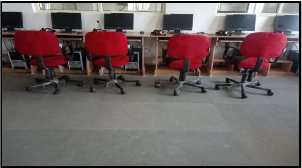
COMPUTER WITH HEADPHONE